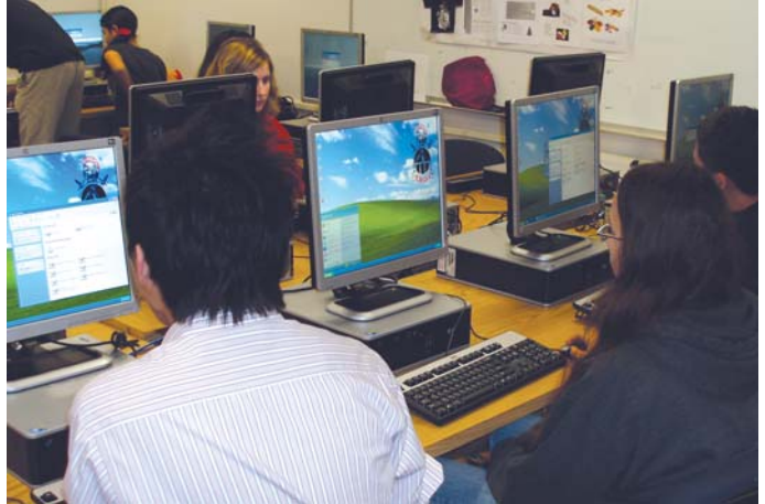
Students in Room 331 enjoy the upgraded speed and software capabilities which encourage creativity and enable them to complete assignments in a timely manner.